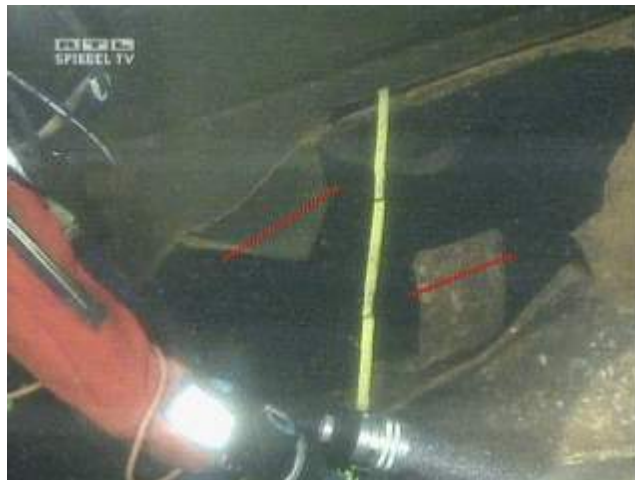
The Hole in the Hull of Estonia