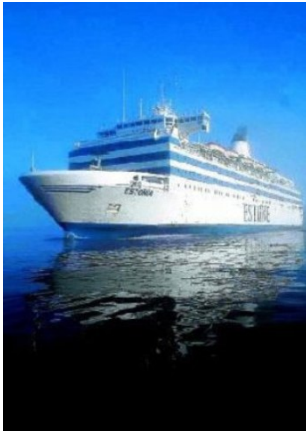
Estonia sank on September 28, 1994, with 852 lives lost.