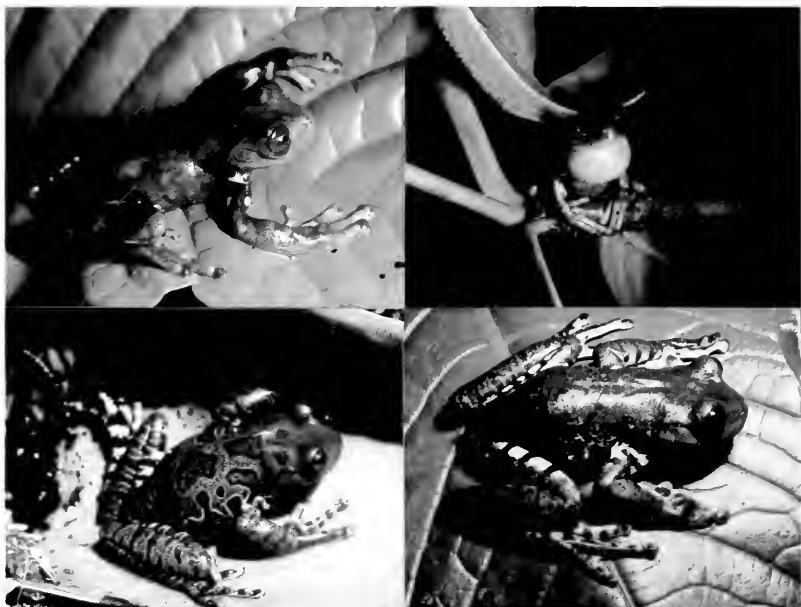
Fig. 2. Hyla statufferorum : Top left and right—adult male, QCAZ 3705. Hyla lariniopygion : Lower left—adult male, QCAZ 4170; lower right—adult male, QCAZ 4171.

(level of spiracle) 11.2; greatest body width (just posterior to orbits) 13.0; eye diameter 1.9; pupil diameter 0.8; interorbital distance 6.3; narial diameter 0.4; internarial distance 5.0; snout-naris 5.1; snout-eye 8.6; snout-spiracle 13.8; naris-eye 3.5; width of oral disc 9.2.